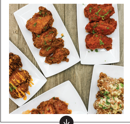
Good Eating INDIANAPOLIS

system. All ingredients used in the libations a good cause. tattersalldistilling.com